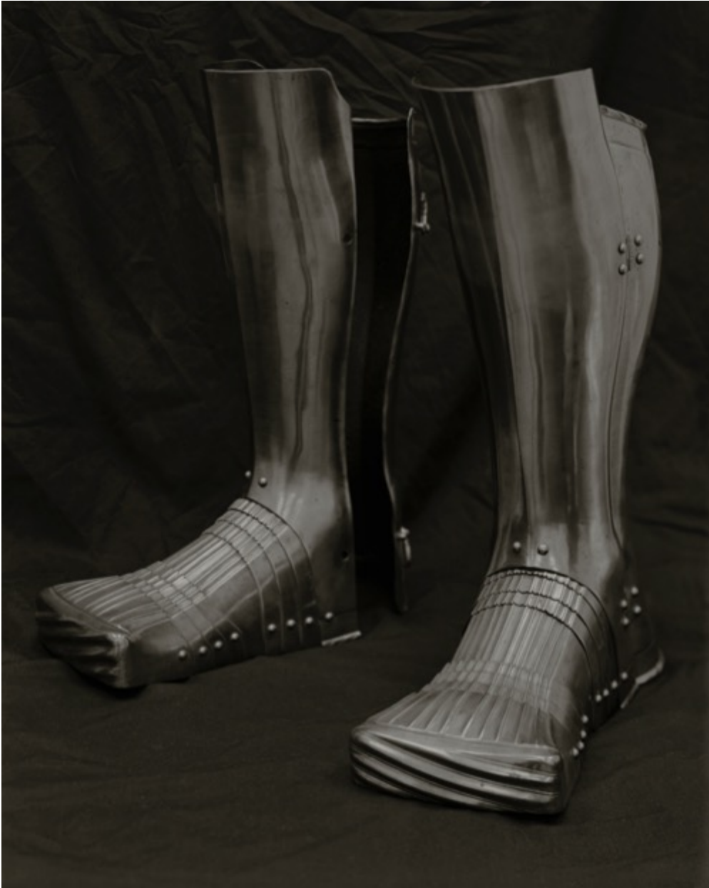
TANYA MARCUSE Sabboton and Greave, c. 1525, Nuremberg, German Higgins Armory Museum, Worcester, Massachusetts, USA Archival pigment print 14x11 inch / 35x28 cm