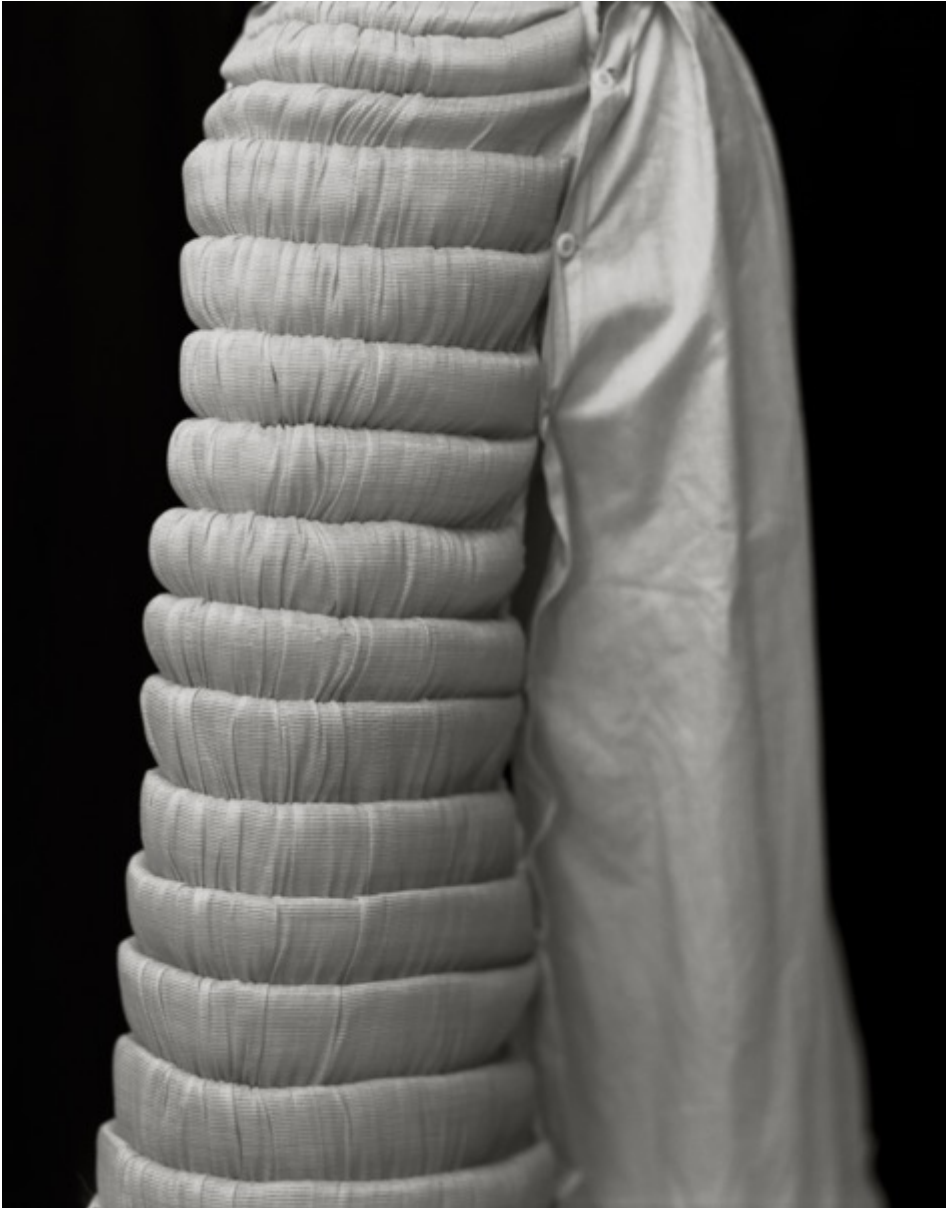
TANYA MARCUSE Layered Bustle c. 1873, Austria Metropolitan Museum of Art, New York, USA Archival pigment print 14x11 inch / 35x28 cm