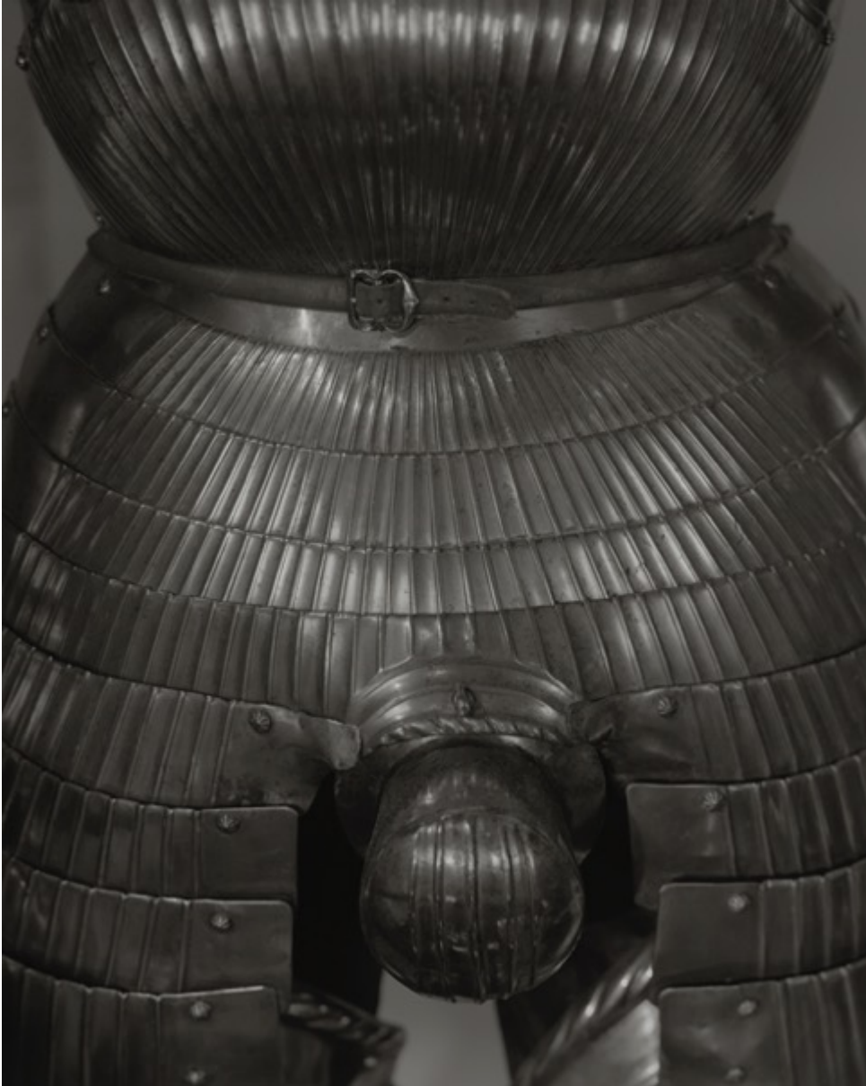
TANYA MARCUSE Maximilian Armor, c. 1515, South Germany Higgins Armory Museum, Worcester, Massachusetts, USA Archival pigment print 14x11 inch / 35x28 cm