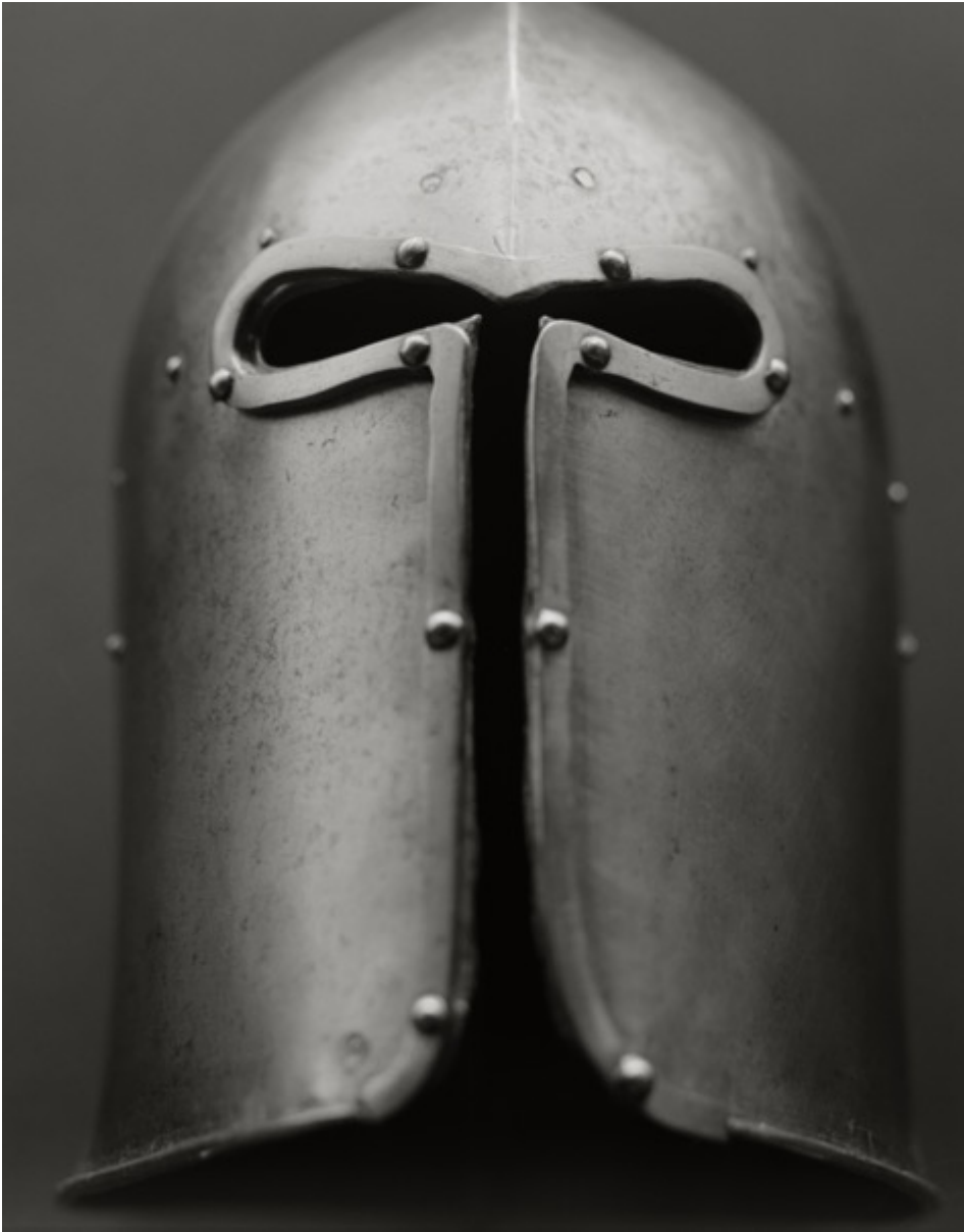
TANYA MARCUSE Steel Barbute c. 1475, Italy Metropolitan Museum of Art, New York, USA Archival pigment print 14x11 inch / 35x28 cm