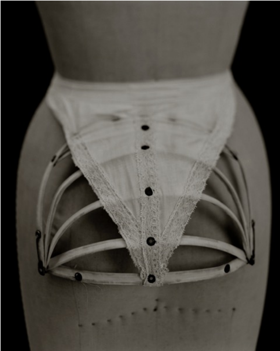
TANYA MARCUSE Collapsible Bustle 1880's, American The Costume Institute, Metropolitan Museum of Art, New York, USA Archival pigment print 14x11 inch / 35x28 cm