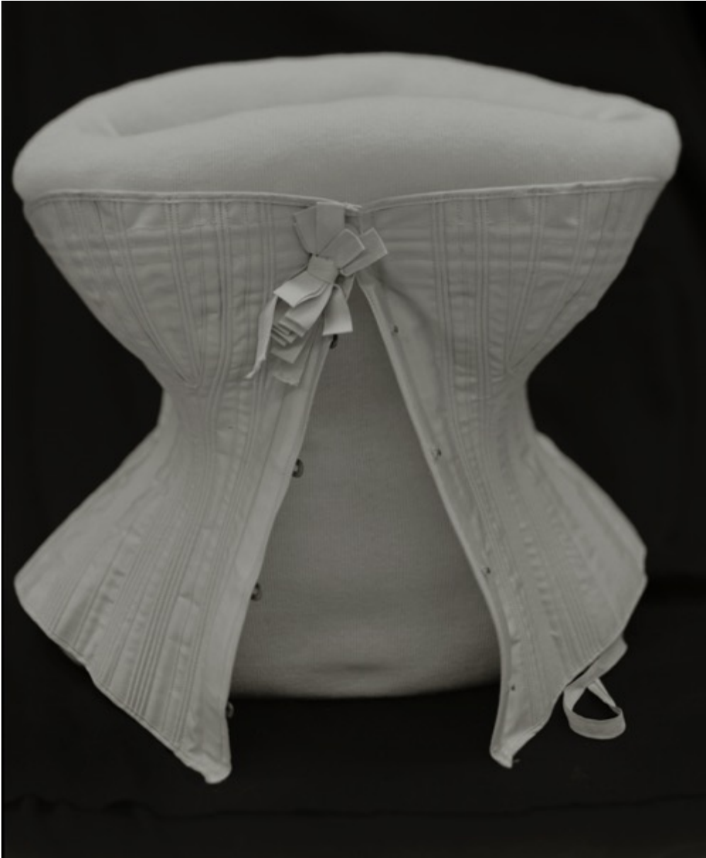
TANYA MARCUSE Corset with Silk Ribbon 1880's Museum at the Fashion Institute of Technology, New York, USA Archival pigment print 14x11 inch / 35x28 cm