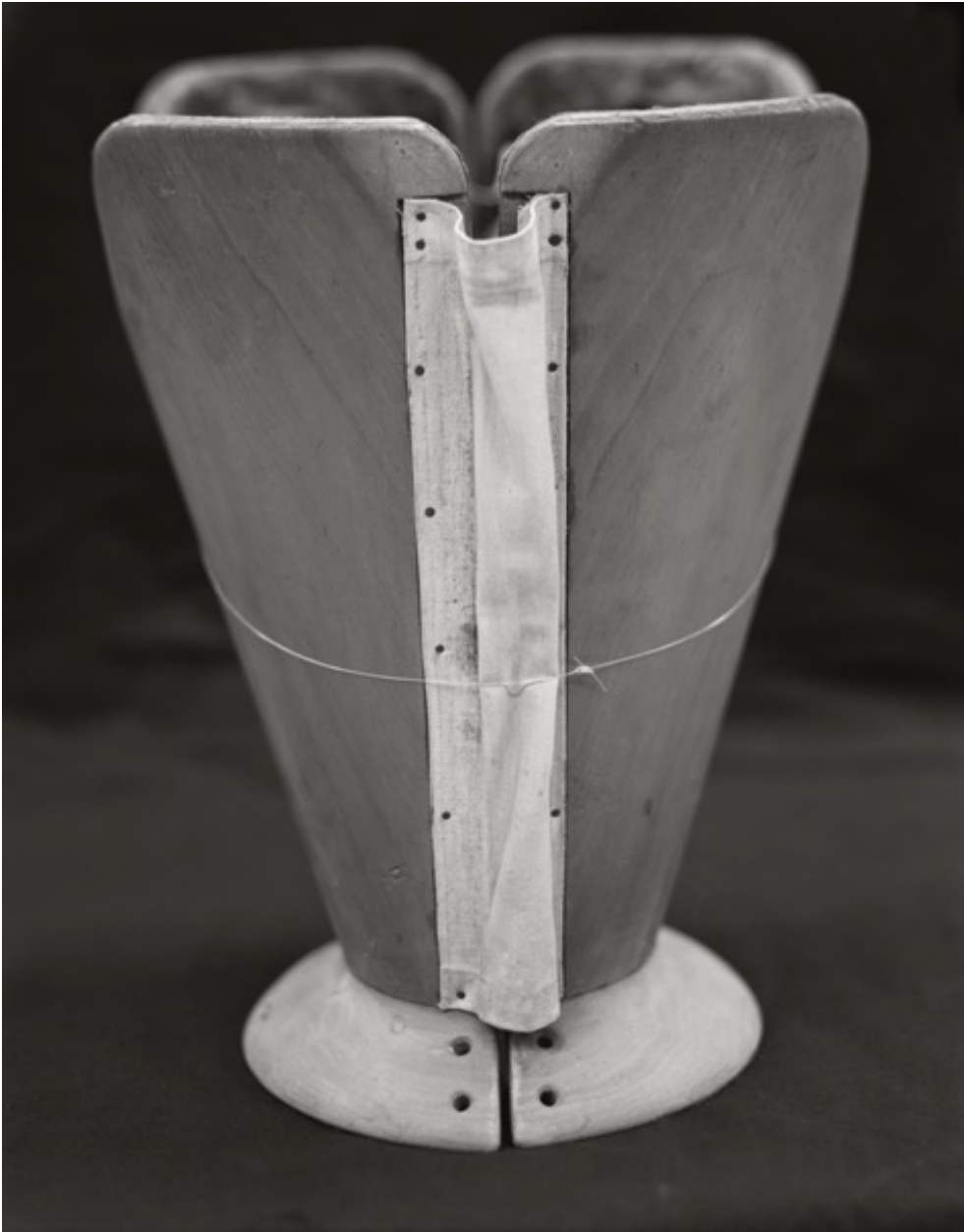
TANYA MARCUSE Wooden Corset 17th century Museum at the Fashion Institute of Technology, New York, USA Archival pigment print 14x11 inch / 35x28 cm