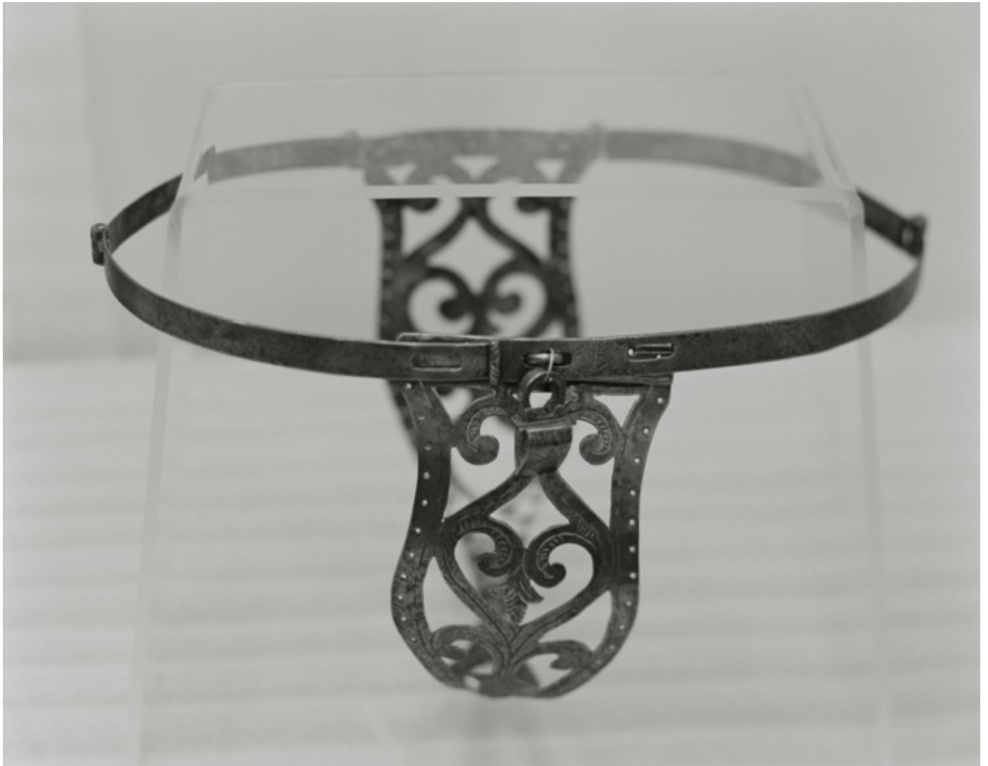
TANYA MARCUSE Chastity Belt Higgins Armory Museum, Worcester, Massachusetts, USA Archival pigment print 14x11 inch / 35x28 cm