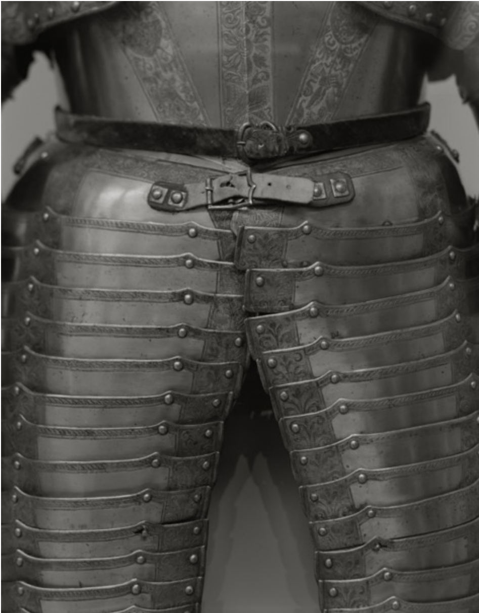
TANYA MARCUSE Cuirassier's Armor, 1621, possibly Dutch Metropolitan Museum of Art, New York, USA Archival pigment print 14x11 inch / 35x28 cm