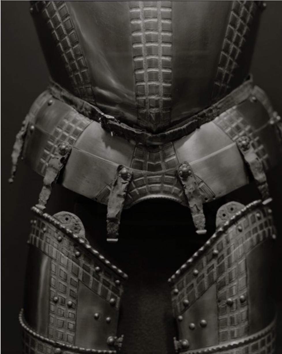
TANYA MARCUSE Elements from a Garniture , 1582, German Metropolitan Museum of Art, New York, USA Archival pigment print 14x11 inch / 35x28 cm