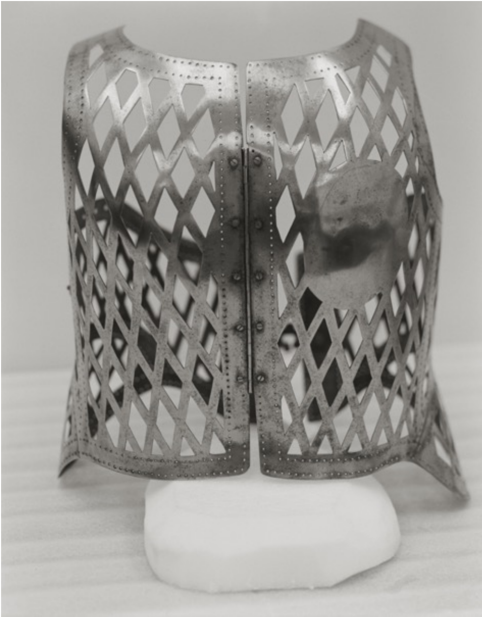
TANYA MARCUSE Male Orthopedic Corset, 18th century, France Higgins Armory Museum, Worcester, Massachusetts, USA Archival pigment print 14x11 inch / 35x28 cm