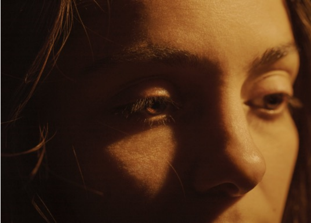
LAURA STEVENS Surface (2023) Archival pigment print 50x65 cm