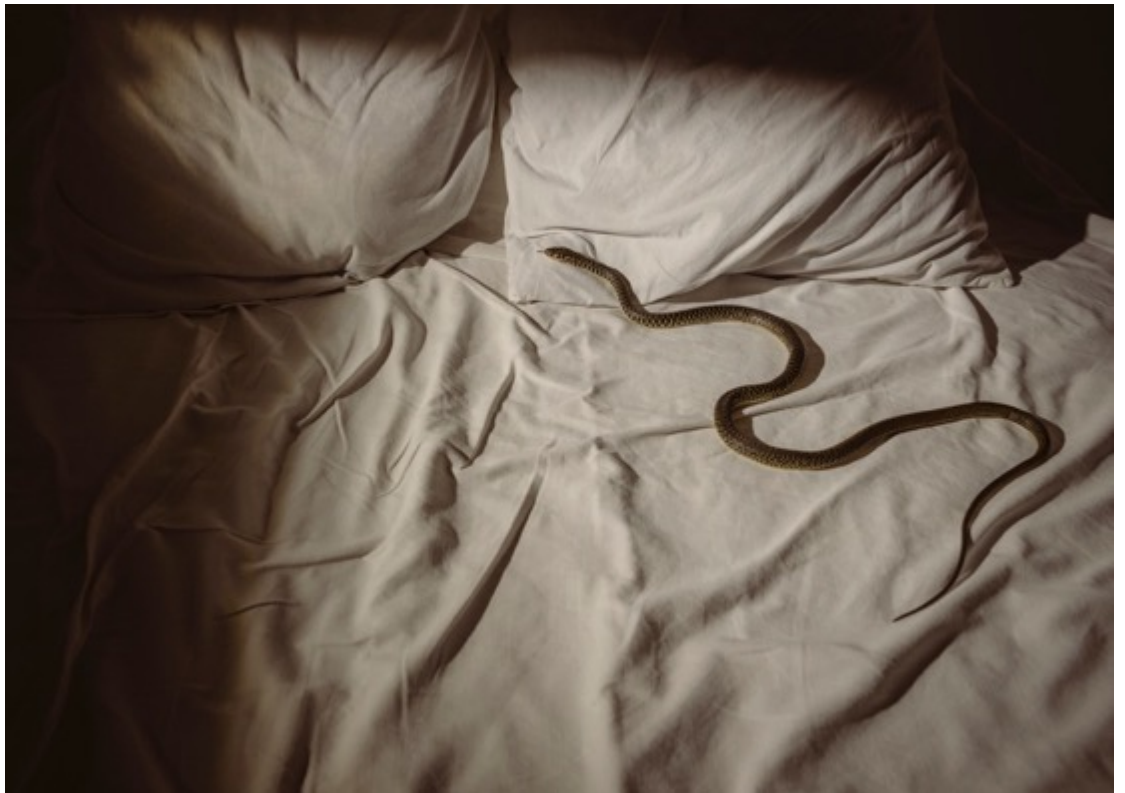
LAURA STEVENS Snake (2023) Archival pigment print 70x100cm