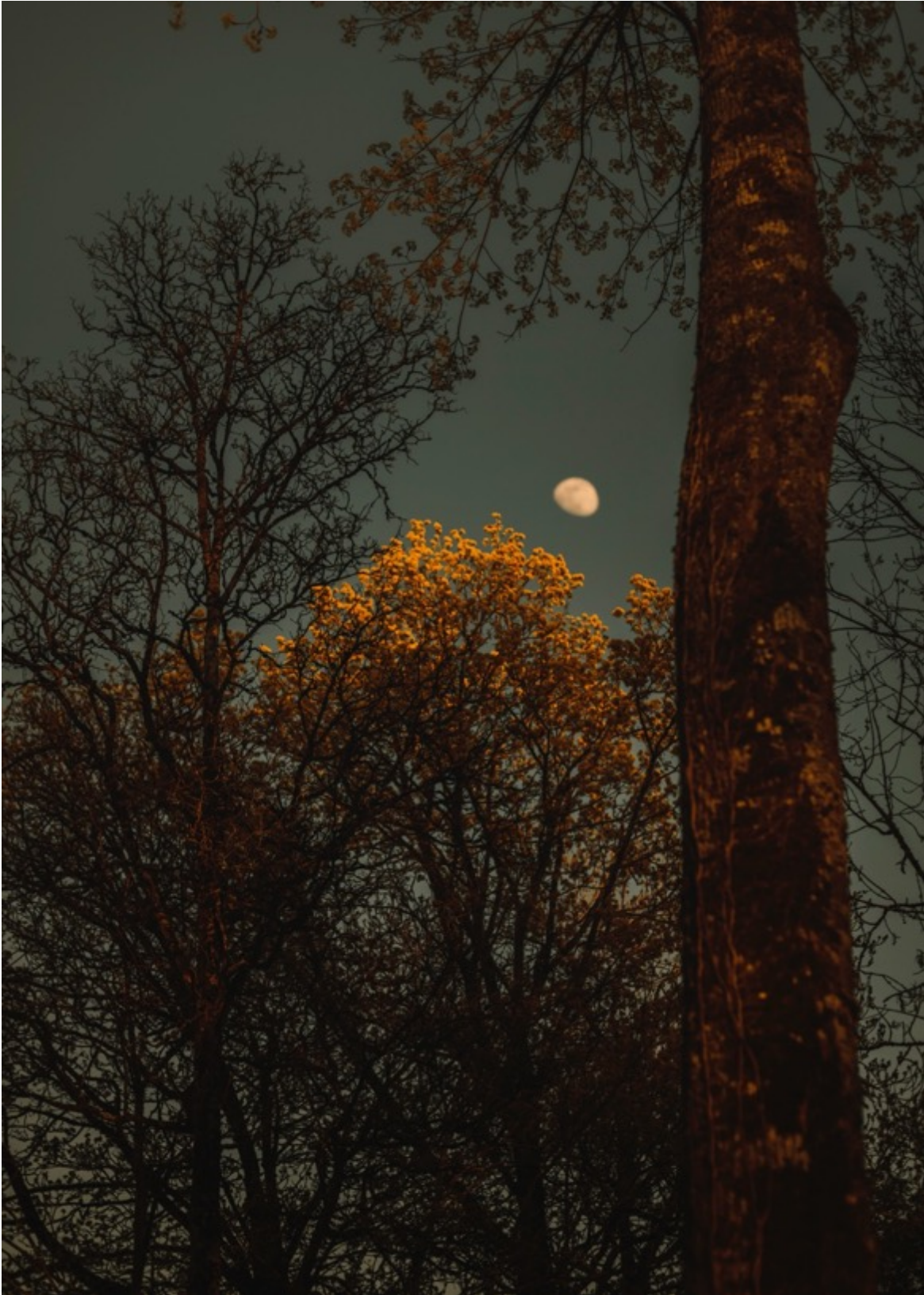
LAURA STEVENS Yellow leaves, waxing moon (2023) Archival pigment print 100x70cm