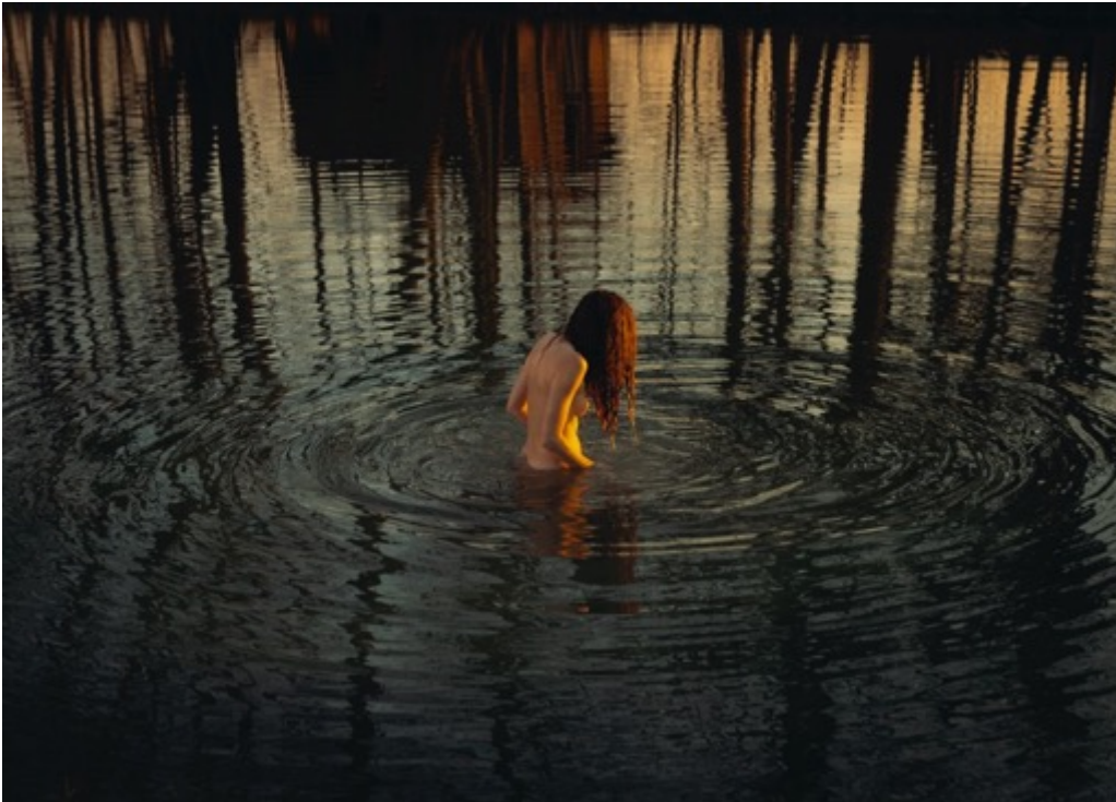
LAURA STEVENS Threshold (2023) Archival pigment print 70x100cm