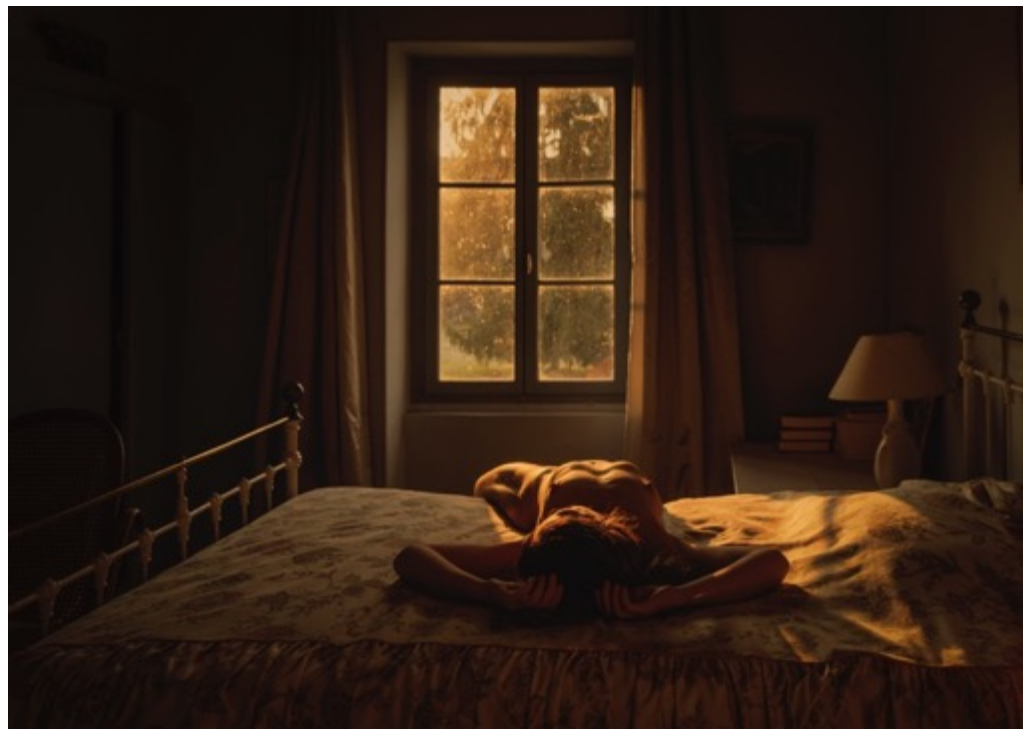
LAURA STEVENS Altar (2023) Archival pigment print 70x100cm