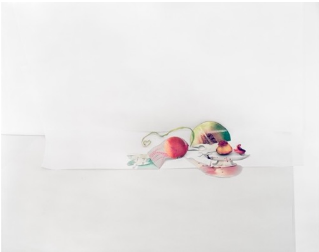
LAURA LETINSKY Untitled #3, from Ill Form and Void, 2011 Archival pigment print Paper 40x48in (100x120cm) /image 31.5x40 inch (78,75x100cm) Edition 6 of 9