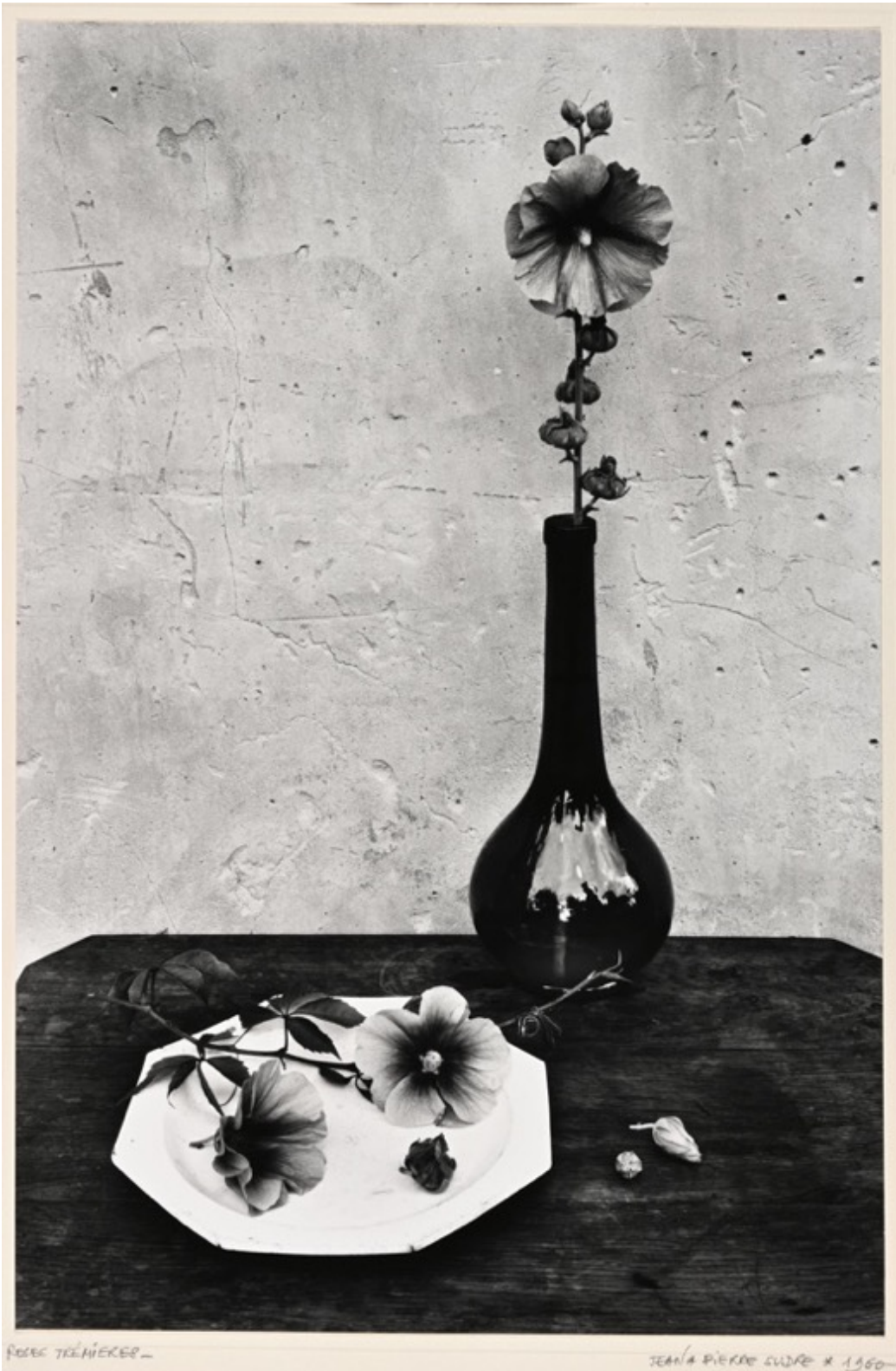
JEAN-PIERRE SUDRE Roses Trémières , 1952, printed in the 1970s silver gelatin print 30x40 cm