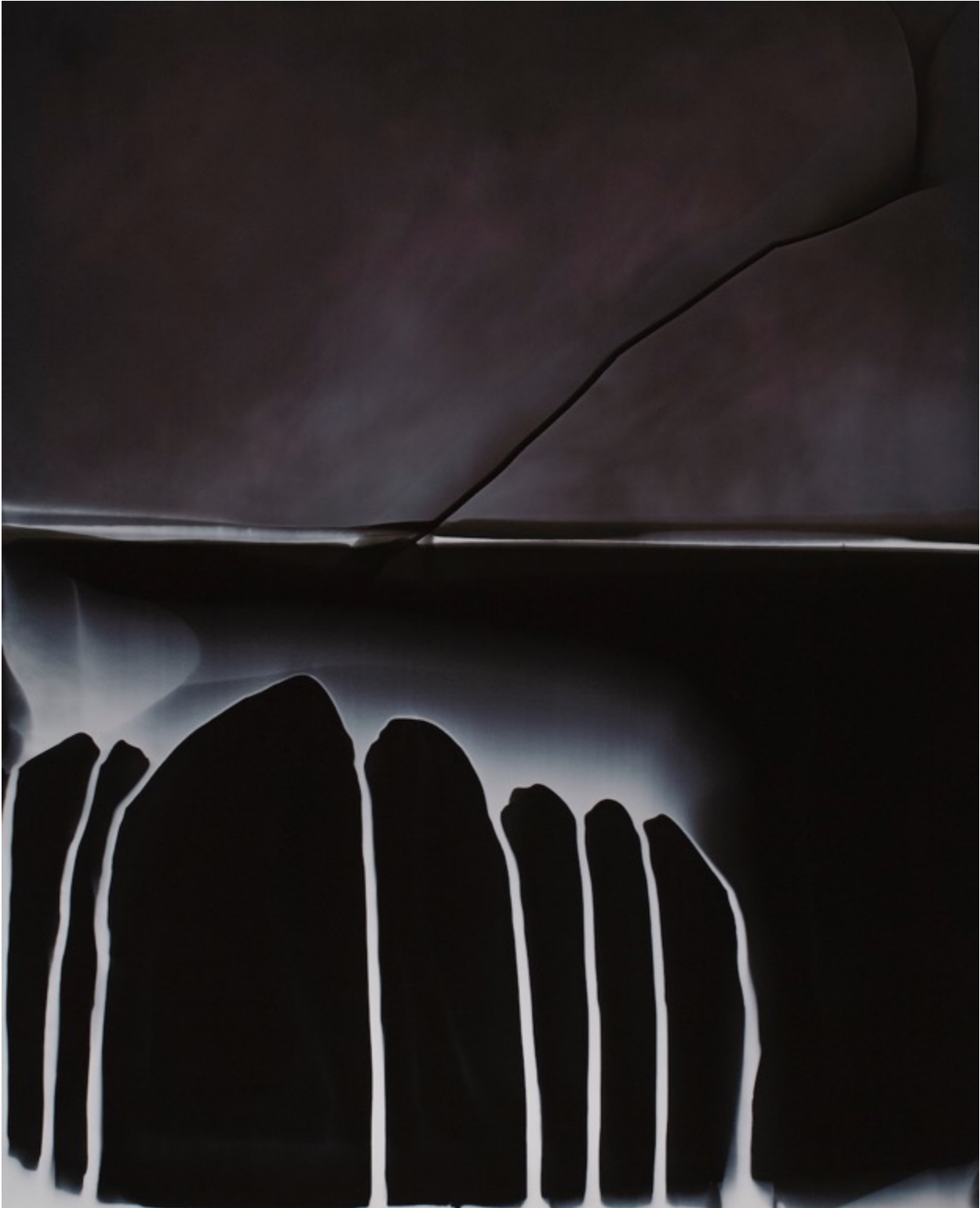
CHUCK KELTON, Resist #23, 2019 Photogram and chemigram on silver gelatin paper 50x40 cm Unique