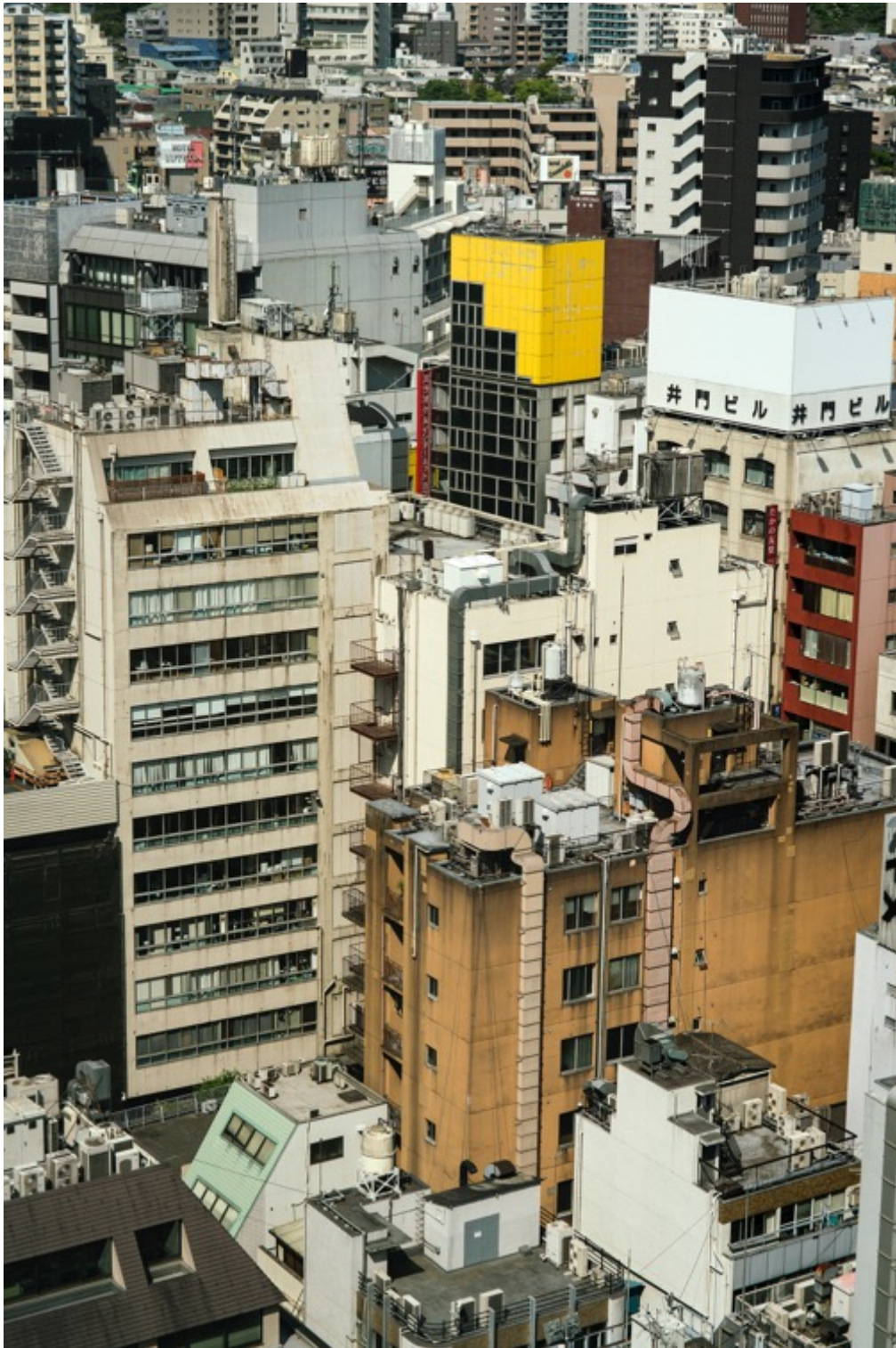
TERRI WEIFENBACH Air and Dreams #173 Archival pigment print 127 x 91.4 cm Edition of 10 + 2 AP

Different formats proposed within the single edition of 10, please enquire