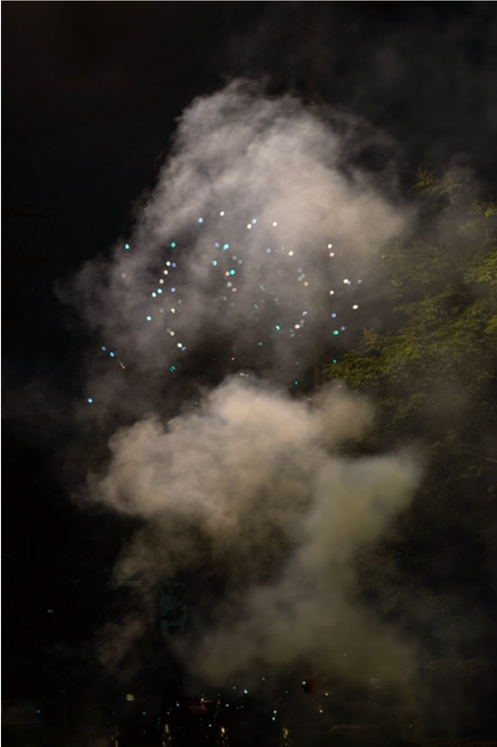
TERRI WEIFENBACH Air and Dreams #197 Archival pigment print / tirage pigmentaire d'archive 76 x 50.8 cm Edition of 10 + 2 AP

Different formats proposed within the single edition of 10, please enquire