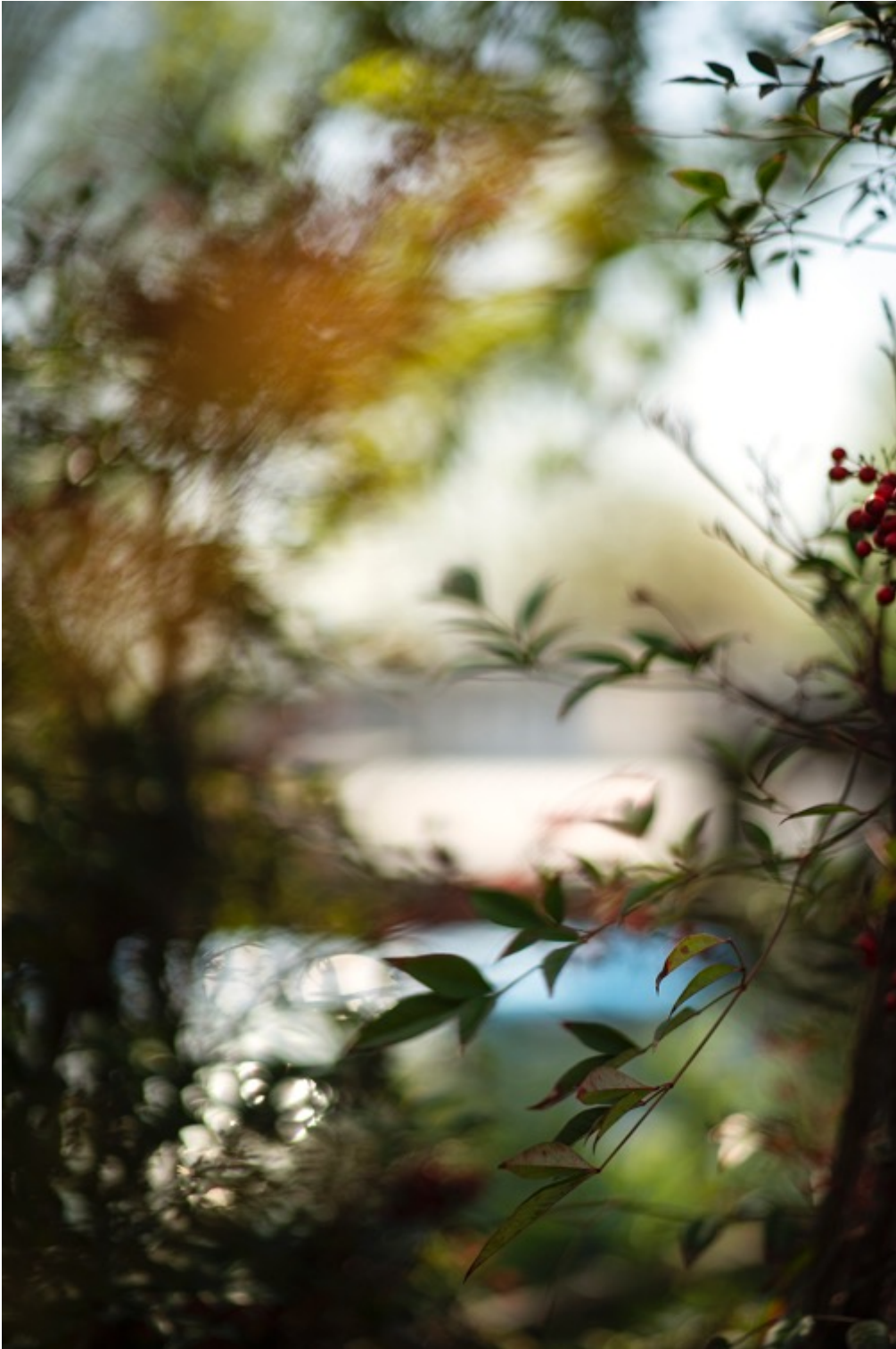
TERRI WEIFENBACH Air and Dreams #5467 Archival pigment print 127 x 91.4 cm Edition of 10 + 2 AP

Different formats proposed within the single edition of 10, please enquire