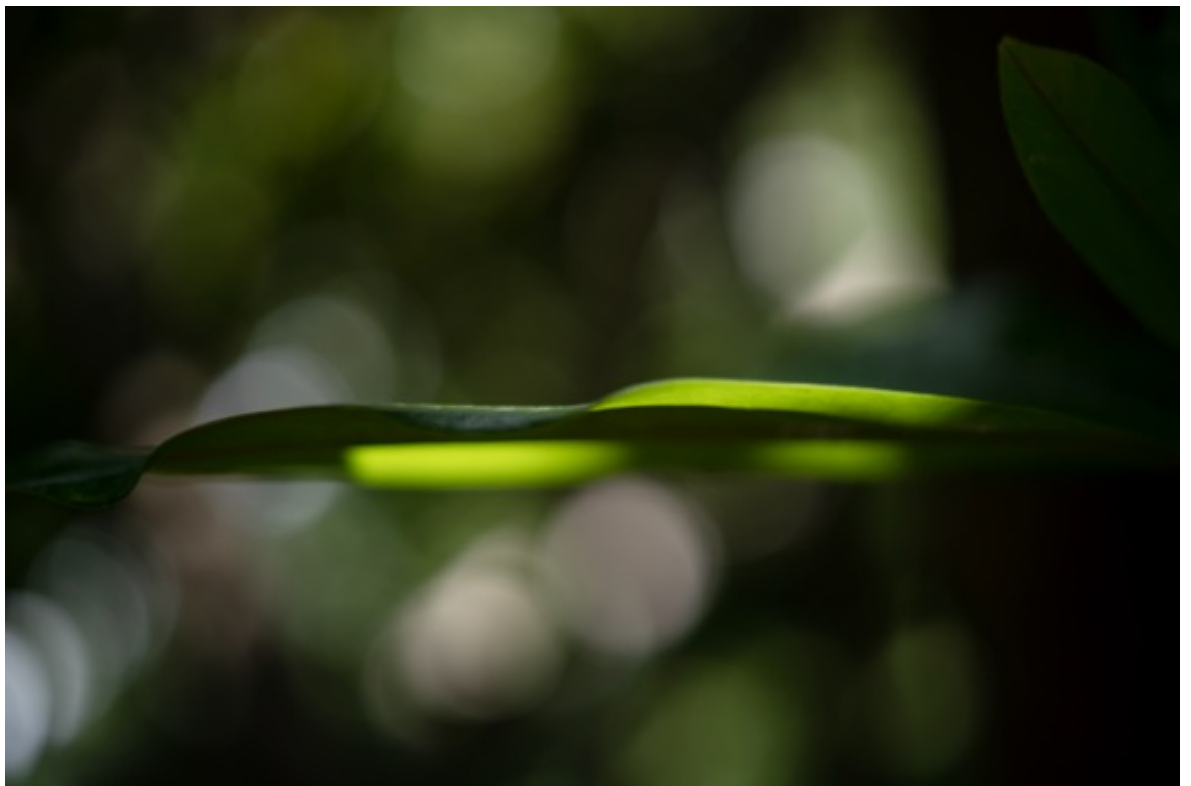
TERRI WEIFENBACH Air and Dreams #110 & #9579 Archival pigment print 76 x 50.8 cm Edition of 10 + 2 AP

Different formats proposed within the single edition of 10, please enquire