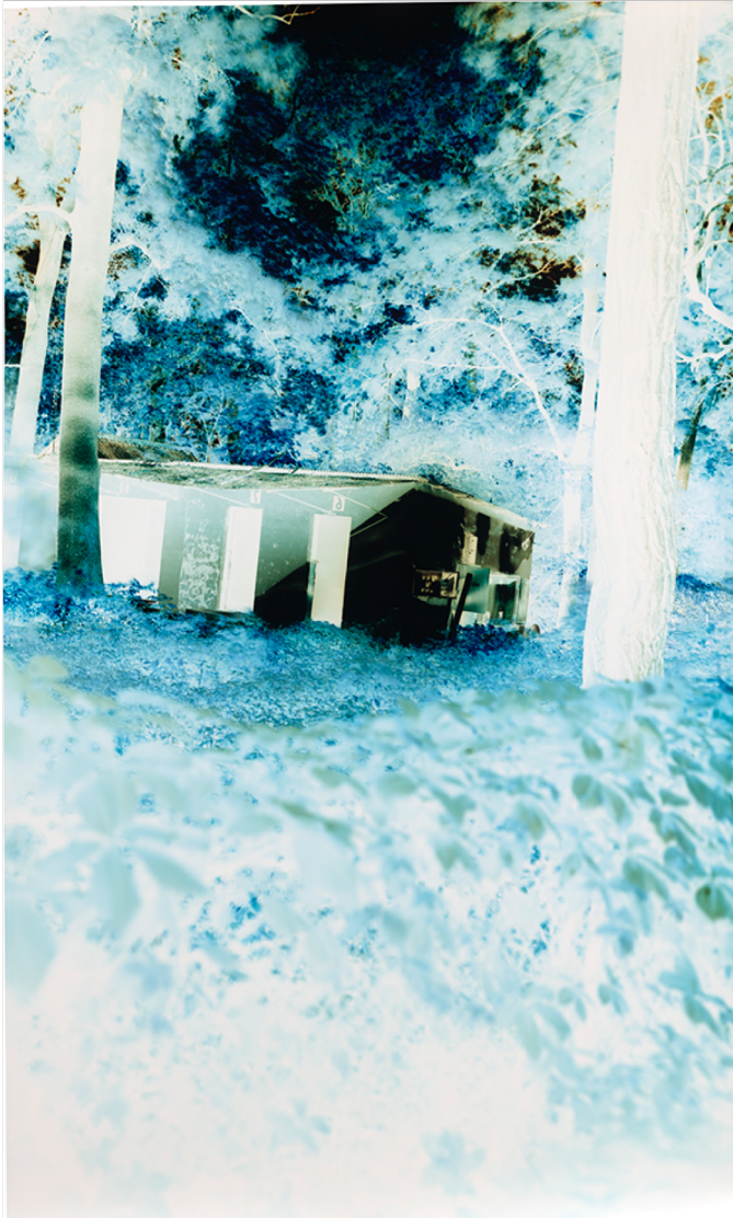
JOHN CHIARA Variation, Népsziget u. on Népsziget island, Budapest, Hungary, 2019 Negative image on Fujiflex Crystal Archive paper 50x30 inches / 127 x 76 cm Signed and dated on verso by the artist Unique