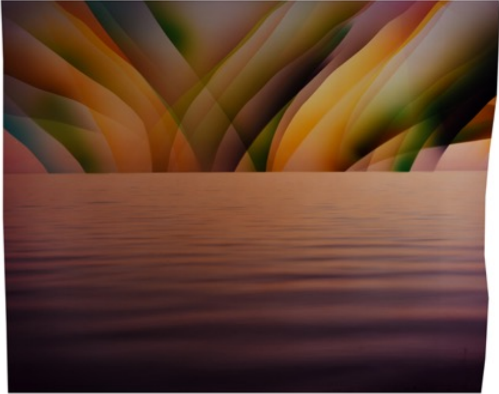
Chloe SELLS The Whisperers, 2016 C-type print 93,5 x 113 cm