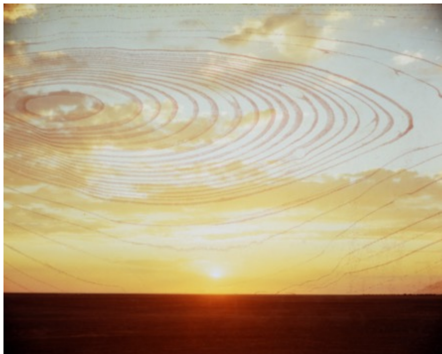
Chloe SELLS How soon is now, 2019 C-Type print with ink 10 x 12 cm Unique