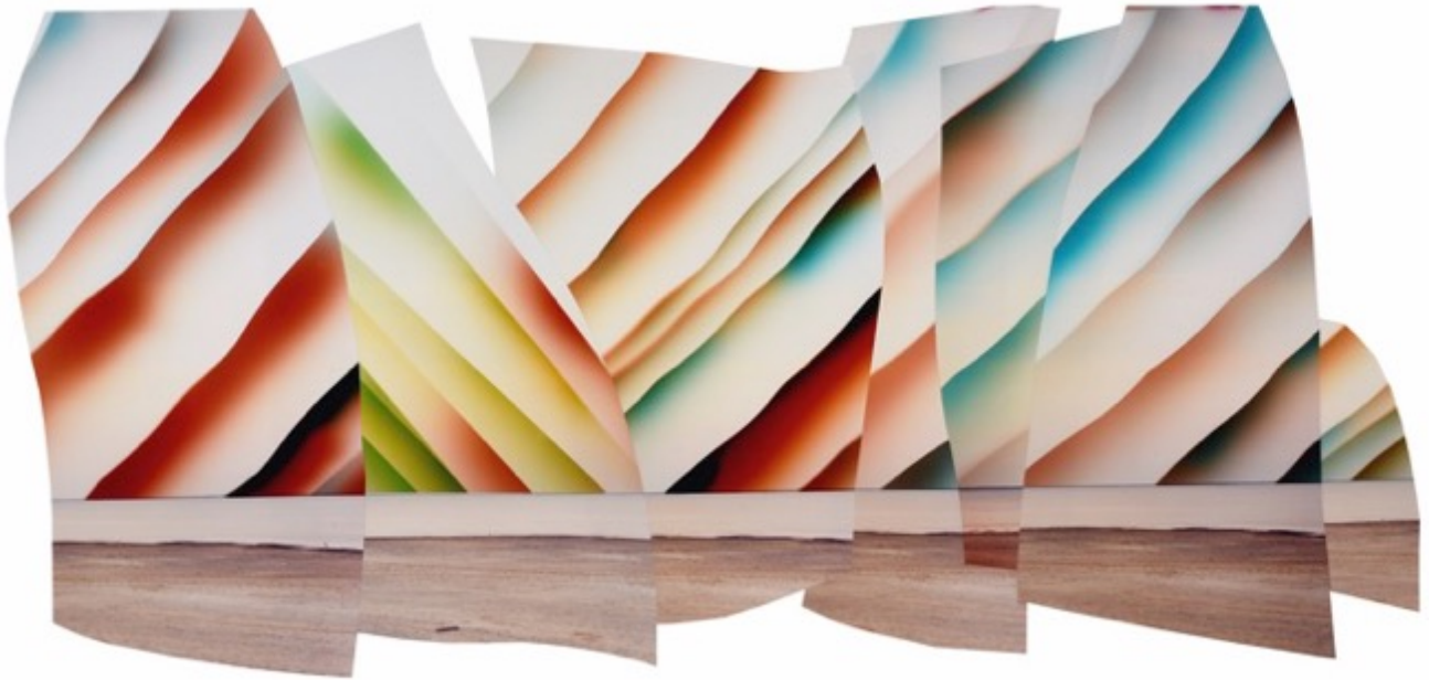
Chloe SELLS The Nare, 2017 C-type print collage 90 x 176 cm