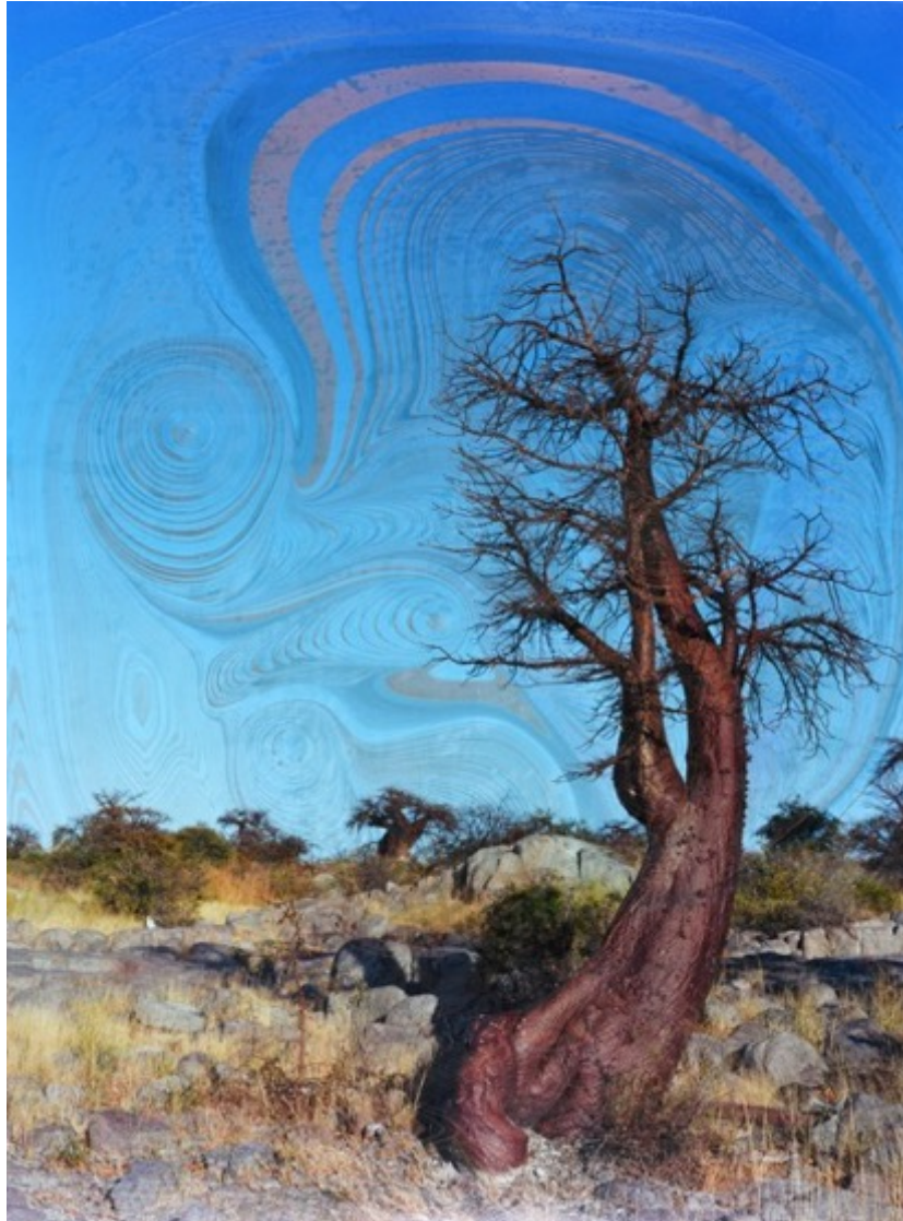
Chloe SELLS Morals of Vision, 2019 C-Type print with acrylic 40 x 32 cm