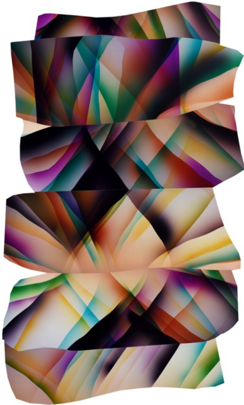
Chloe SELLS The Form , 2017 C-type print collage 168 x 106 cm Unique