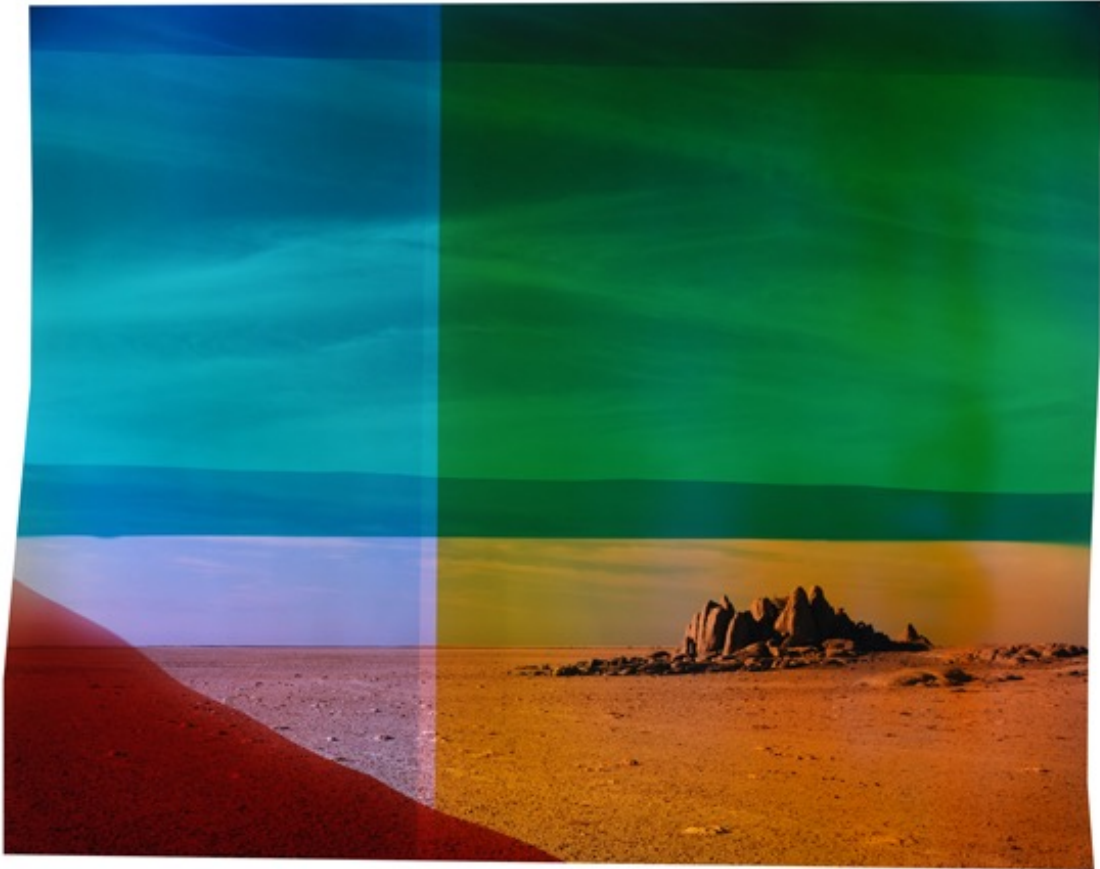
Chloe SELLS The Turning away, 2017 C-type print 93,5 x 113 cm