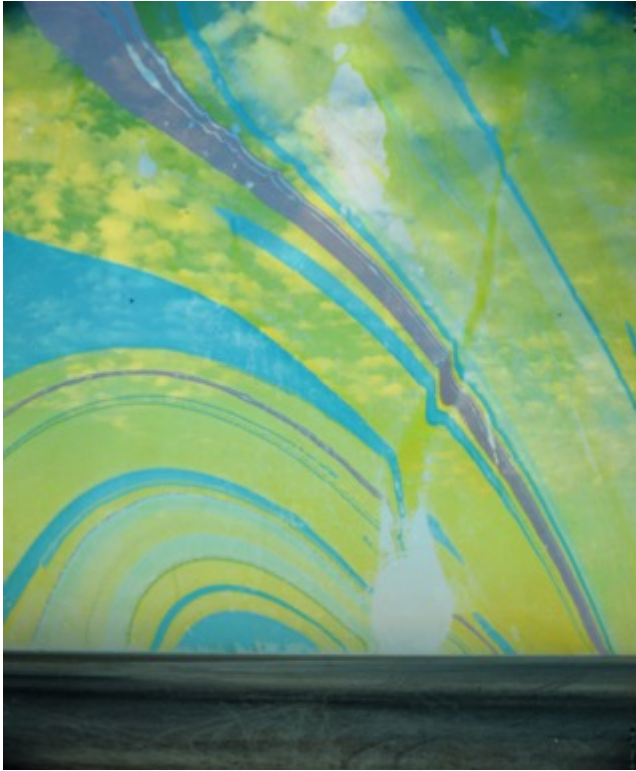
Chloe SELLS Fall at my door, 2019 C-Type print with ink 10 x 12 cm Unique