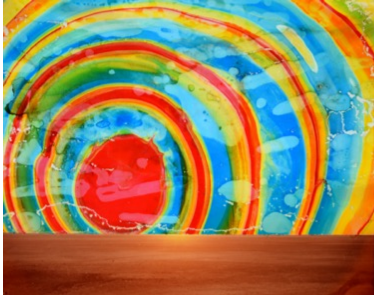
Chloe SELLS Feel the sun, 2019 C-Type print with ink 10 x 12 cm Unique