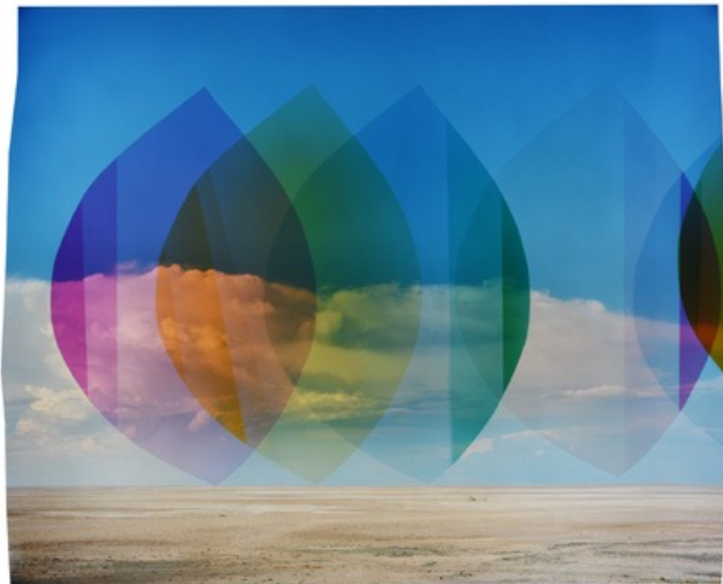
Chloe SELLS Shadow At Morning, 2017 C-type print 93,5 x 113 cm