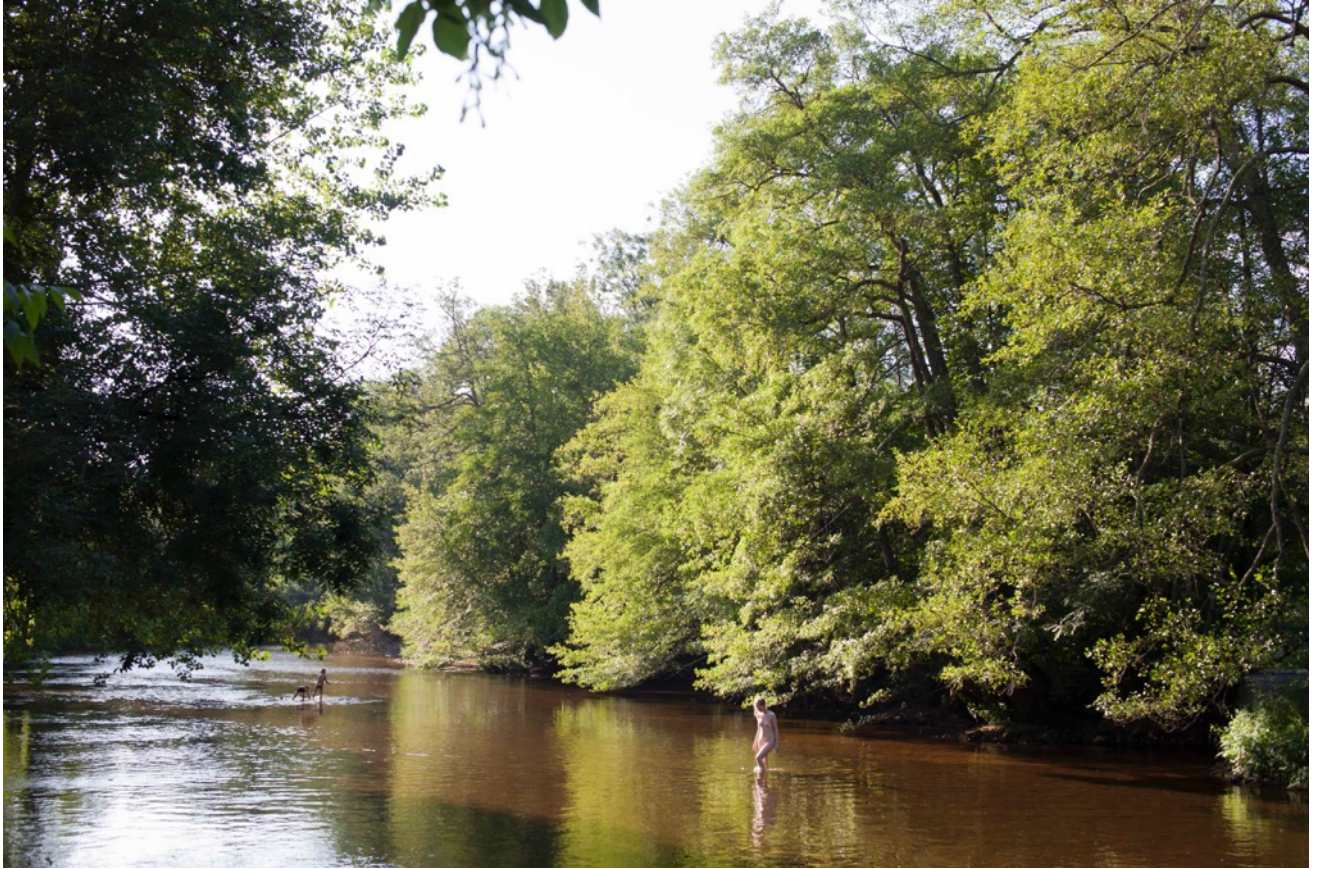
Sans titre (Bourgogne), 2016 Tirage numérique sur papier FineArt Canson Edition limitée de 5 100 x 66 cm