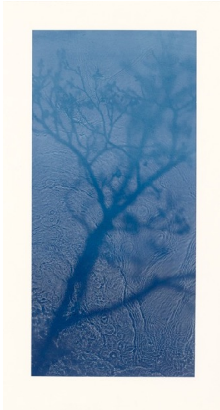
Willow, 2018 Polymer photogravure (2018) 61 X 29 cm