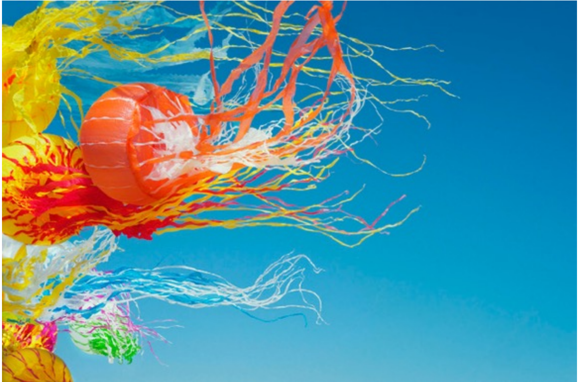
Medusae, 2018 From Heavenly Creatures series Pigment print 85 x 55 cm / 34" x 22"