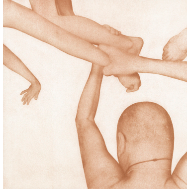
Family matter 6, 2008/2013 Gum bichromate print with blood 25.5 x 25.5 cm