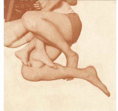
Family matter 7, 2008/2013 Gum bichromate print with blood 25.5 x 25.5 cm